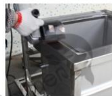
6 Tank Polishing