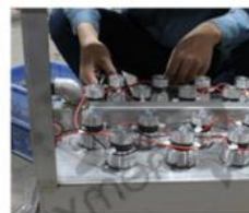
5 Skymen Transducer Wiring