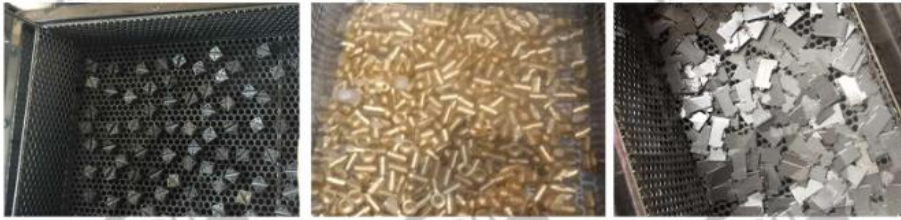
Copper, aluminum, stainless steel, hardware industry applications