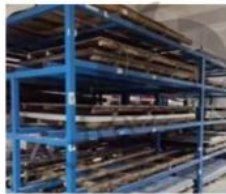
1 Raw Material