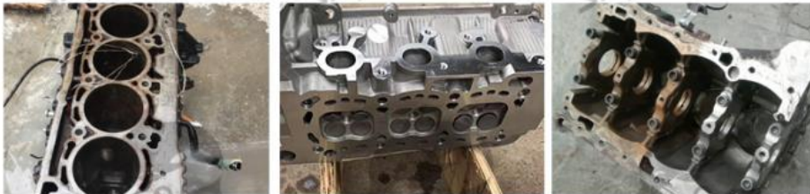
Auto parts, aviation, shipbuilding, industry applications