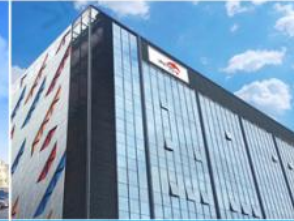
Skymen Fuyong Marketing Center