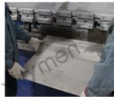
2 Board Cutting