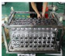
4 Transducer Installation