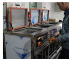
8 Age Testing