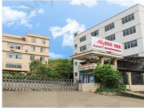
Skymen Shaoguan Production Base

Professional Ultrasonic Cleaner Manufacturer