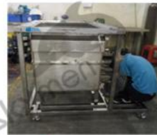
3 Tank Welding