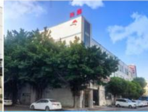
Skymen Shajing R&D Center