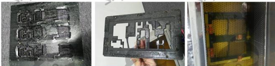
Fixture industry application