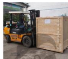
9 Skymen Factory Shipping